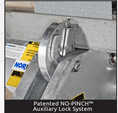
Patented NO-PINCH™ Auxiliary Lock System

The enclosed housing design is a structural welded assembly constructed with 5/16" side plates and 1/2" high tensile reinforcement on leading edge to withstand repeated impacts from backing trailers.