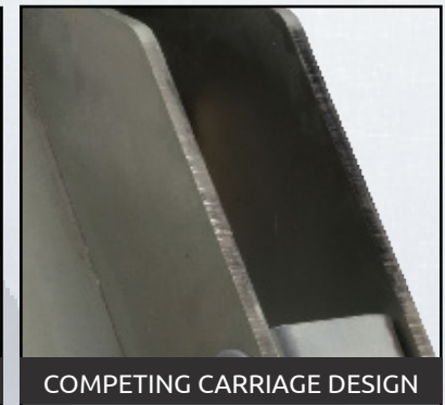
COMPETING CARRIAGE DESIGN