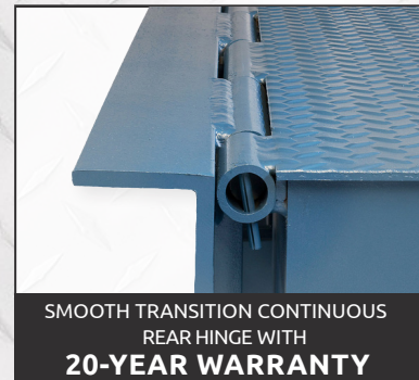
SMOOTH TRANSITION CONTINUOUS REAR HINGE WITH 20-YEAR WARRANTY