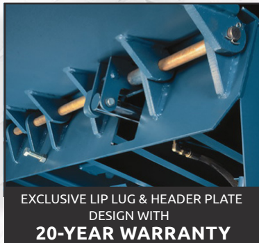
EXCLUSIVE LIP LUG & HEADER PLATE DESIGN WITH 20-YEAR WARRANTY