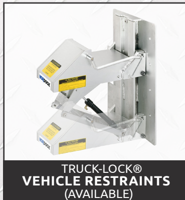
TRUCK-LOCK® VEHICLE RESTRAINTS (AVAILABLE)